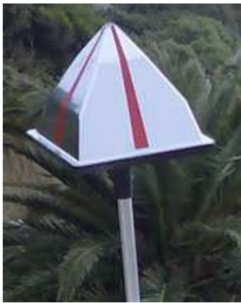
The Eagle Eye

One of the final steps in looking after the grapes prior to harvest is trying to prevent the birds from feasting on the grapes. We use the Eagle Eye bird scarer. It is an optical bird scarer that harmlessly deters birds from unwanted areas by making use of light beams reflected from direct sunlight or artificial light. The reflective pyramid rotates via an electric motor, sending the beams around in a menacing pattern. The light spectrum reflected back by the Eagle Eye disorients birds in flight by limiting their vision significantly. This causes the bird to deviate in flight and fly to another destination.