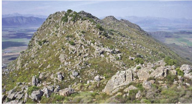
View of northern ridge of Kasteelberg

Riebeek Valley Tourism, on the square in Riebeek Kasteel during published opening hours only.