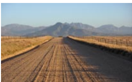
The road to Groenberg

This route starts east of Hermon, and is signposted Bo-Hermon. As above you will need to determine whether you wish to return by the same way, or plan to have transport in Wellington. Soon after starting you