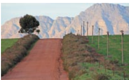
Farm road on Paardeberg

Neighbouring Paardeberg is a virtually self-contained granite outcrop, containing numerous sand farm roads with little passing traffic. A great opportunity to explore a little known, scenic area on two wheels.