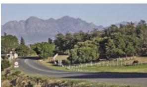
R311 into Riebek West

Enjoy the wonderful views of seemingly limitless vineyards, wheatfields and Kasteelberg.