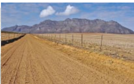
Kasteelberg ifrom farm road

There are two routes in the Valley (see separate leaflets), one from Riebeek Kasteel, the other Riebeek West. They are not unduly challenging, and allow riders to take in the stunning mountain and landscape vistas that make up the area.