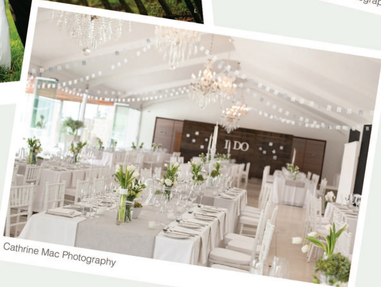
Cathrine Mac Photography

WEDDINGS | CONFERENCES | FUNCTIONS | SPECIAL EVENTS