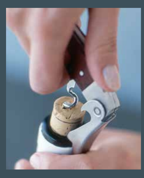
Follow us on Facebook facebook.com/WSWine