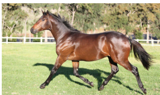
Legal Eagle as a Yearling at Avontuur, before travelling up to Johannesburg for the 2013 Emperor's Palace National Yearling Sale.