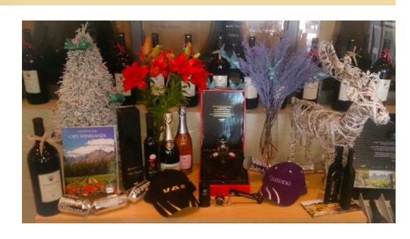
A selection of gifts on display.