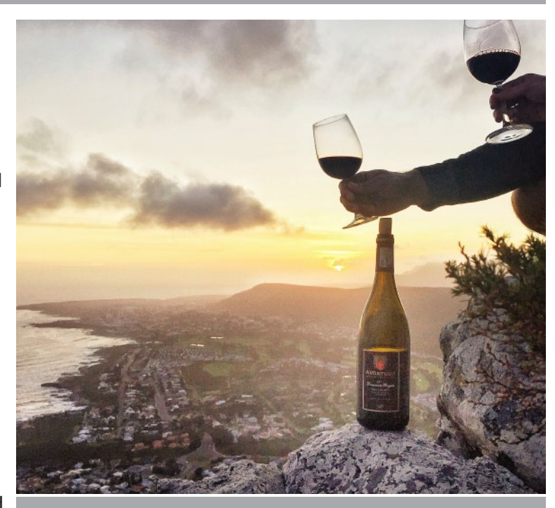
Here's one of our favourite #AvontuurMoments

The Avontuur Estate Restaurant is open daily for breakfast and lunch and for dinner from Wednesday to Saturday. The restaurant can be contacted at openhand@polka.co.za or +27 21 855-4600.